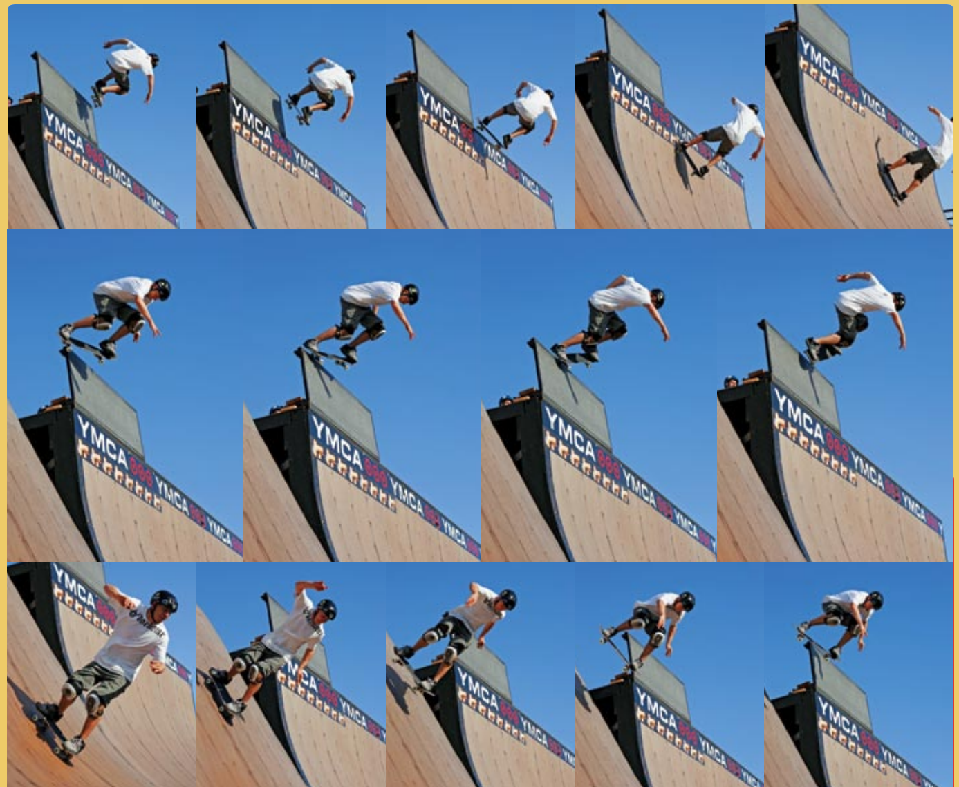
Alley-oop nollie to fakie five-0.