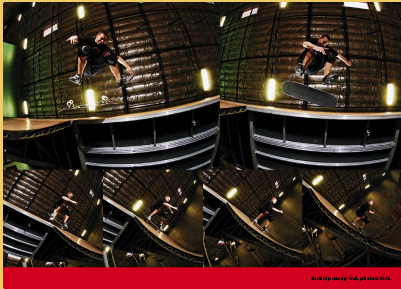
Kickflip nosegrind.

I don't know—it's just luck sometimes, skating every day, and just having fun. I love skating, so the more I