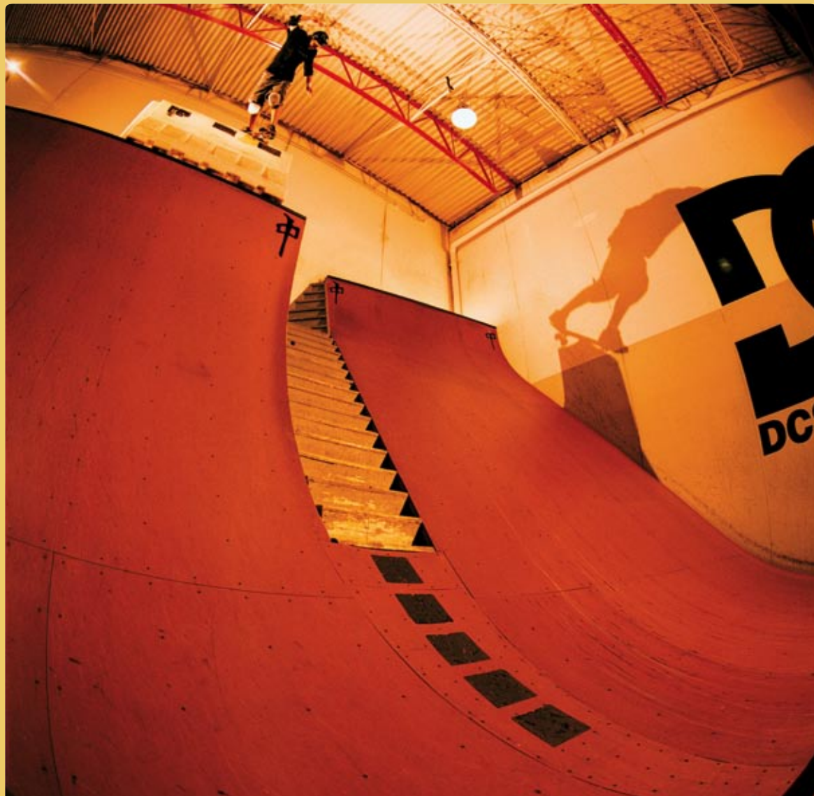
Backside lipslide to gap out.